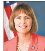
U.S. Rep. Kathy Castor U.S. Representative for Florida's 14th Congressional District